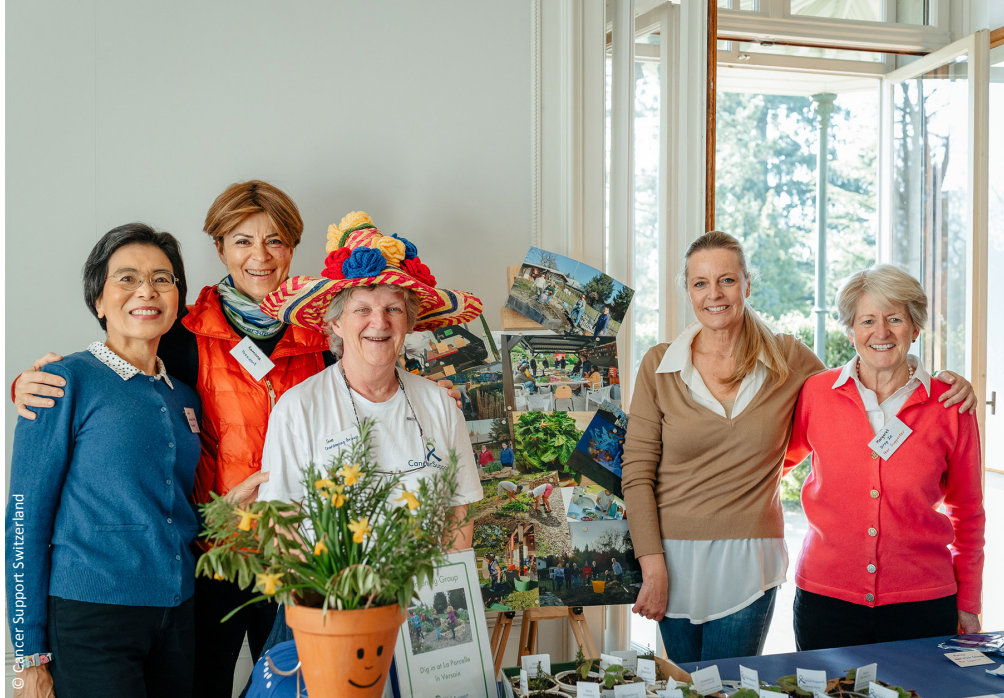
Caption: Some of the team and volunteers at Cancer Support Switzerland in Geneva

When Hanadi was diagnosed with cancer, her fear and panic were compounded because she knew she would go through treatment away from her home country. Through Cancer Support Switzerland, she found a supportive community that helped to alleviate her fears.