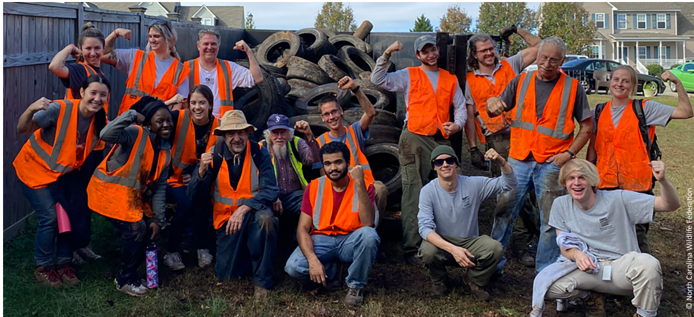
Caption: In November 2023, the team at North Carolina Wildlife Federation worked with students to remove a huge pile of rubbish from what will become a new Wake County public park in North Carolina, the US. Together they removed thousands of pounds of rubbish, including tyres, scrap metal, old furniture, a sofa, pipes, metal canisters, and old housing materials.

Across North Carolina, a vast new highway is taking shape. But this one doesn't involve bulldozers or miles of asphalt. From pollinator pitstops in families' backyards to large-scale roadside habitat restoration, the Butterfly Highway is a growing network of native flowering plants supporting pollinators across the state.