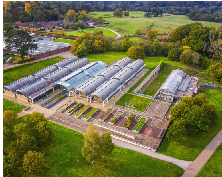
Caption: Aerial view of the Millennium Seed Bank, at Kew’s wild botanic garden at Wakehurst in Sussex.

To find out more about the Millennium Seed Bank, check out our online report to watch the video.