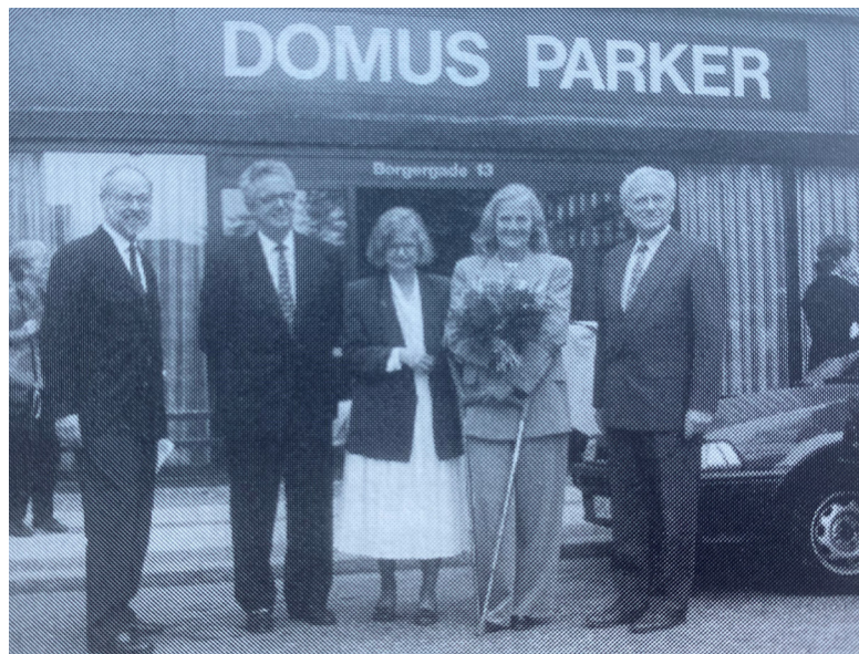
Caption: Inauguration of The Rehabilitation Counsel for Torture Victims in Copenhagen, Denmark, on 15 May, 1994.

The sheer scope of our partners' engagement is astounding. We are contributing to stronger communities and a healthier planet by: protecting children from sexual violence; advancing more sustainable ways to fuel and feed the world; protecting biodiversity and regenerating landscapes; supporting the rights of all people, especially the most marginalised; contributing to robust women's movements; strengthening policies to ensure housing for everyone; and making sure that no child with learning differences gets left behind. In addition, through special interest grants, Oak Trustees have supported everything from music and the arts to demining, cancer research, humanitarian relief, racial justice, and even restoring oysterbeds in New York harbour.