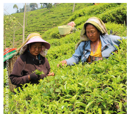
Caption: The photos in the India section of the report illustrate our partners' work to support tea garden workers in West Bengal.