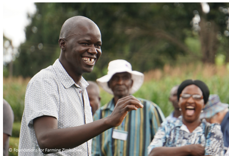
Caption: Foundations for Farming is a grassroots organisation that seeks to create sustainable livelihoods and food sovereignty in Zimbabwe, and boost the profitability of small-scale farmers.

Oak has supported Foundations for Farming since 2022, as part of our Zimbabwe Programme, which funds local organisations involved in supporting the hopes and aspirations of Zimbabweans, particularly those furthest from opportunity. We support organisations that help families and communities thrive, and those that build skills and foster entrepreneurship.