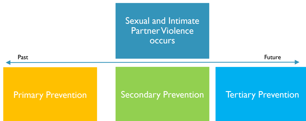
Figure 1. Different levels of prevention

Prevention of sexual and intimate partner violence before it occurs in the first place must ultimately be our goal. Prevention is often separated into three phases: Primary prevention, are those interventions and approaches that aim to prevent violence before it occurs; whilst secondary and tertiary prevention, involve approaches that focus on the more immediate responses to violence and the long-term care post violence (Figure 1.)